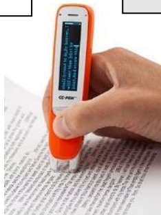
Claro Read Pens